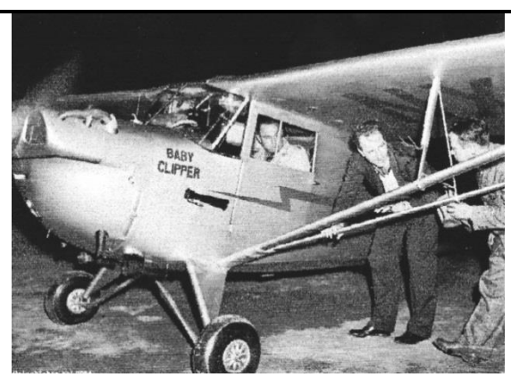
May 28, 1939

If you can help man the museum please contact us. Leave a message or email us. We have a lot of history to display and to present. Maine has a vast aviation history background, let's help preserve it.