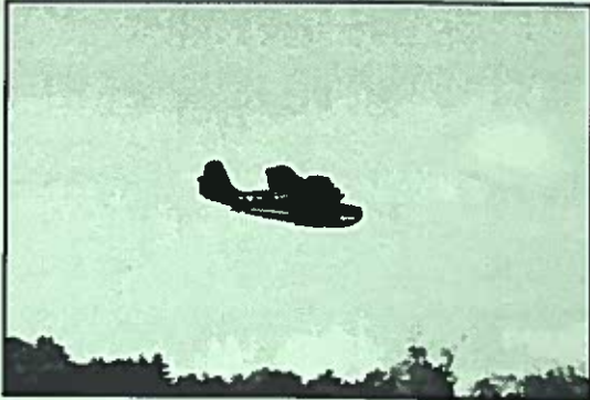
Grumman Goose flies low in the sunshine (!) at the Greenville Seaplane Fly-In.