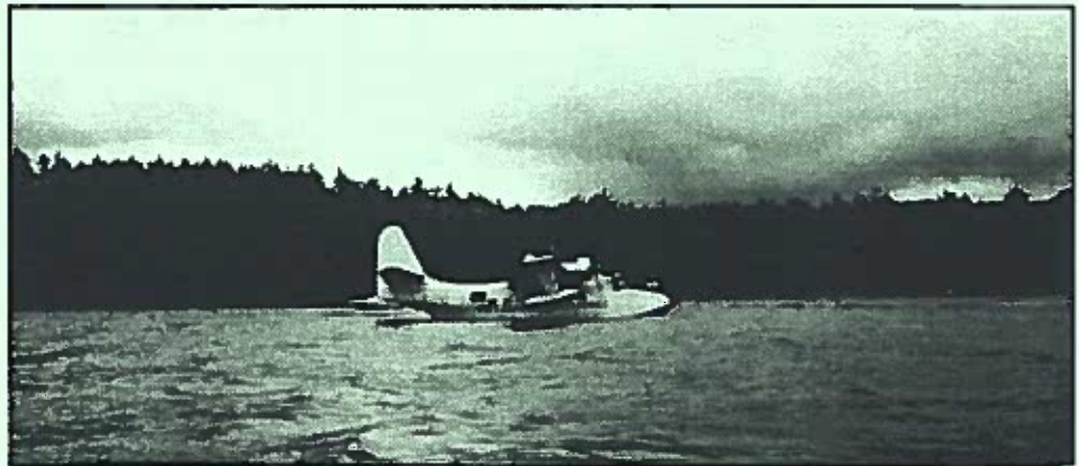
The Grumman Albatross Amphibian of the Frye Island Air Force on Sebago Lake, July 4, 1998 as Frye Island became Maine's newest town.