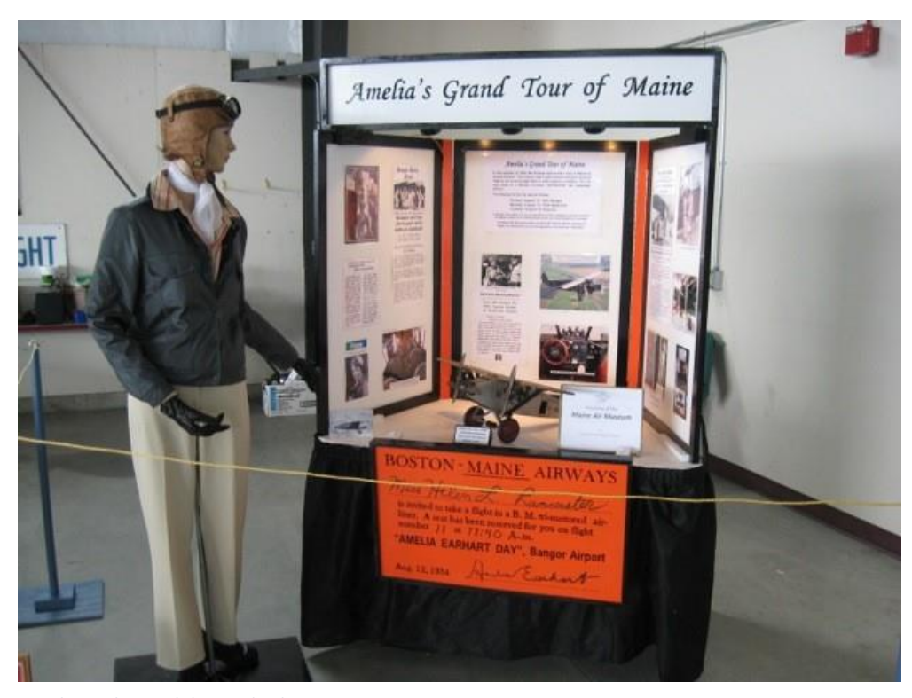
Amelia Earhart Exhibit on display at BIA