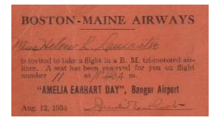
Photo of ticket from 1934 Tour, donated to the Museum by Ms. Lancaster's niece, René Kein

Since the airliner only held ten passengers, and two hundred passengers were given rides at each of the three stops, those must have been three very busy days. A list of the two hundred Bangor area women and children who were lucky enough to get tickets for one of the flights, is on display with the exhibit, thanks to reporting by the Bangor Daily News. A list of 140 local-area passengers is available for viewing when the exhibit visits Augusta, thanks to an August 13, 1934 article in the Daily Kennebec Journal.