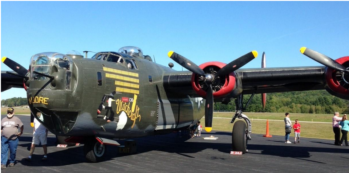
B-24J Liberator – one of over 19,000 produced for WWII and one of only 2 still airworthy and flying