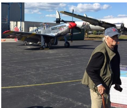
P-51C Mustang "Betty Jane" - featuring a full set of dual controls for flight training