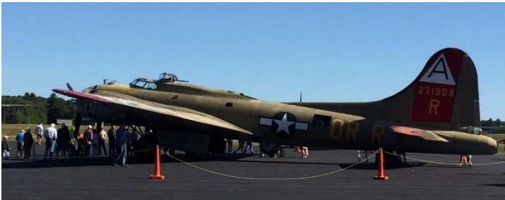
B-17G Flying Fortress "Nine-O-Nine"

From September 23 through September 25, 2015, the Collings Foundation's Wings of Freedom Tour, showcasing fully-restored World War II aircraft, visited the Auburn-Lewiston Municipal Airport. The Collings Foundation is a non-profit, educational foundation located in Stow, Massachusetts. According to the foundation's website, "the 'Wings of Freedom Tour' has two goals: to honor the sacrifices made by our veterans that allow us to enjoy our freedom; and to educate the visitors, especially younger Americans, about our national history and heritage." Pictured below are several of the aircraft on display in Auburn this fall.