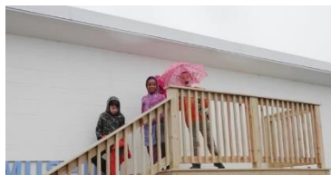
The Hank Marois Viewing Platform is enjoyed by Christ's Home School students on a recent visit.