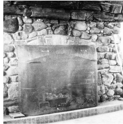
Fireplace inside the airport office