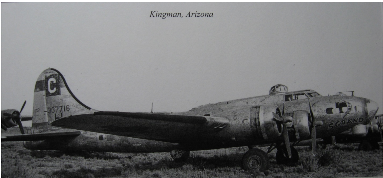
5 Grand parked at Kingman Army Air Field

The United States had more than 16,000,000 men and women in uniform at the cessation of hostilities. Soon, soldiers overseas clamored for release from military duty. President Truman, himself a World War I army veteran in France, empathized with the plight of troops and sailors. He ordered the Pentagon to speed up its military demobilization and get the servicemen and women home. But this was not the only headache for the military chiefs to deal with for they also had to contend with the tremendous surplus of war equipment no longer needed. For the Army Air Forces and the Navy, this meant the disposition of more than 200,000 aircraft. Congress established the War Assets Administration during the later part of the war years to work with the Depression Era Reconstruction Finance Corporation and with the military to deal with this problem. The WAA designated 30 locations where surplus aircraft were to be flown for their eventual disposition. One of these sites was the Kingman Army Air Field in Kingman, Arizona; it was here that the AAF flew in many of their heavy bombers that landed at Dow Field in May and June of 1945. These victorious and lauded aircraft came to rest at Kingman and awaited their fate.