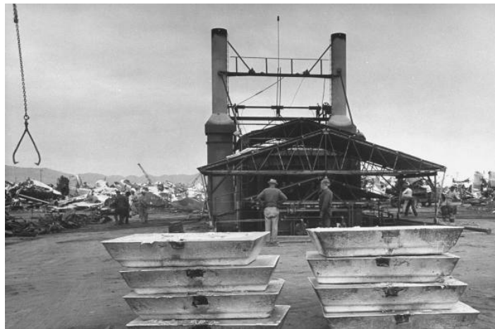
One of three smelters at work with the remains of bombers now "ingots" in the forefront

The smelting operation at Kingman was methodical and thorough. Specialized work crews removed the radial Wright and Pratt and Whitney engines from each bomber. Then, workers gutted the interior of a bomber (the AAF had previously removed bomb sites and machine guns) of radio and oxygen equipment, life rafts and fire extinguishers, and other equipment. A powerful tractor dragged each empty hulk over to an area where a guillotine type contraption cut off the wings and then chopped the fuselage into manageable sections; workers fed these parts into one of three smelters. Each smelter operated 24 hours a day and consumed 35 bombers per day.