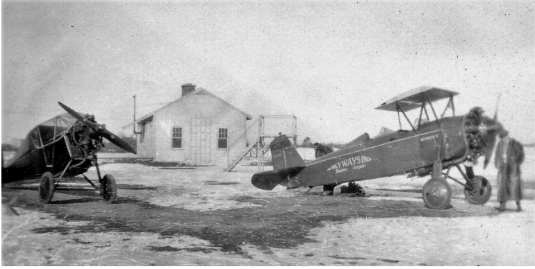
Office at the Portland Airport in Scarborough