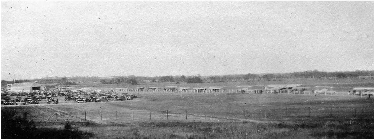
September, 1928, fly-in at the Portland Airport in Scarborough

Operation of the Portland Airport moved to the Stroudwater Field in the late 1930s because the Scarborough location proved too limited in runway size to accommodate the increasingly larger aircraft. The Scarborough field was 193 acres, and triangular in shape. There were two runways, which had sod and clay surfaces. One was 2,800 feet by 300 feet and the other was 3,600 feet by 400 feet. Once operations were moved out of Scarborough, that field was relegated mostly to pilot training and air shows. The field is now the site of the Scarborough Industrial Park. The Stroudwater field, now known as the Portland International Jetport, was not similarly limited in potential.