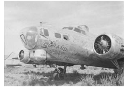
5 Grand awaits her doom

One of these bombers was the famous 5 Grand mentioned earlier. Adorned with the signature of more than 38,000 workers (the weight of the additional ink cost the B-17G seven miles per hour loss in speed compared to similar aircraft), the 5 Grand joined the 338th Bomber Squadron of the 96th Bombardment Group in England. From there, 5 Grand flew 78 successful bombing missions over Nazi Germany. Now at Kingman, she sat parked among thousands of similar B-17s and B-24s in the arid sun baked desert. The WAA gave cities and other organizations an opportunity to claim famous aircraft as war memorials. But they needed to act quickly as the WAA developed a plan to bring in three huge aluminum smelters to deal with the surplus aircraft and reduce each of them to an ingot with the proceeds upon sale going back into the U.S. Treasury.