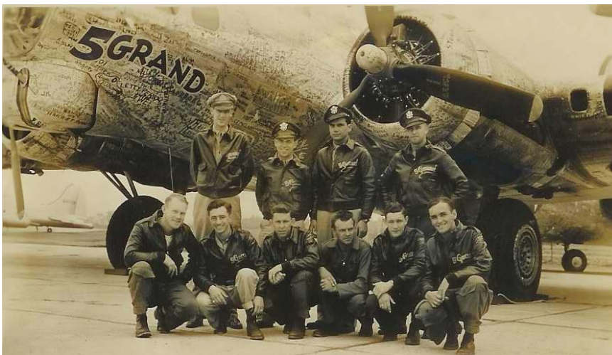
5 Grand and crew at Dow Field, June 14, 1945

The parade of B-17 and B-24 bombers through the Air Transport Command base went on for more than a month. By the end of June, nearly six thousand airmen and their aircraft had flown through Bangor. This bustle of activity gave the Signal Corps detachment at Dow a photo opportunity resulting in pictures which are preserved for posterity by the Bangor Public Library. Some of the planes already had earned war renown. Among these were the Nine-O-Nine B-17 which flew 140 bombing missions over the ETO without a casualty, killed or wounded. The 5 Grand , another photographed B-17, was the 5,000th Seattle-built Boeing and bore the signatures in black and red ink of everyone who had a part in its manufacture there.