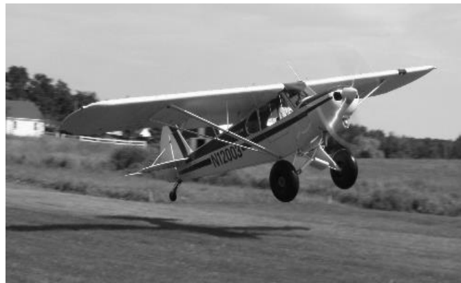
Miller's Field Fly-In pictures. Top is a line-up of visiting aircraft. Bottom, a 1957 Piper PA-18A on a short-field takeoff.